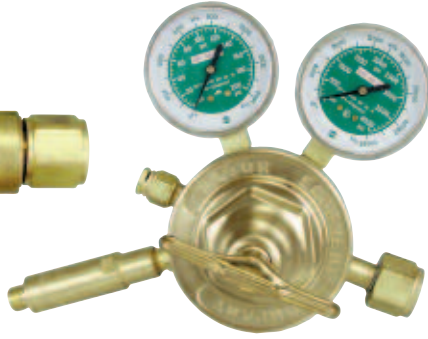
FB-OR Regulator Mount