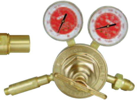
FB-FR Regulator Mount